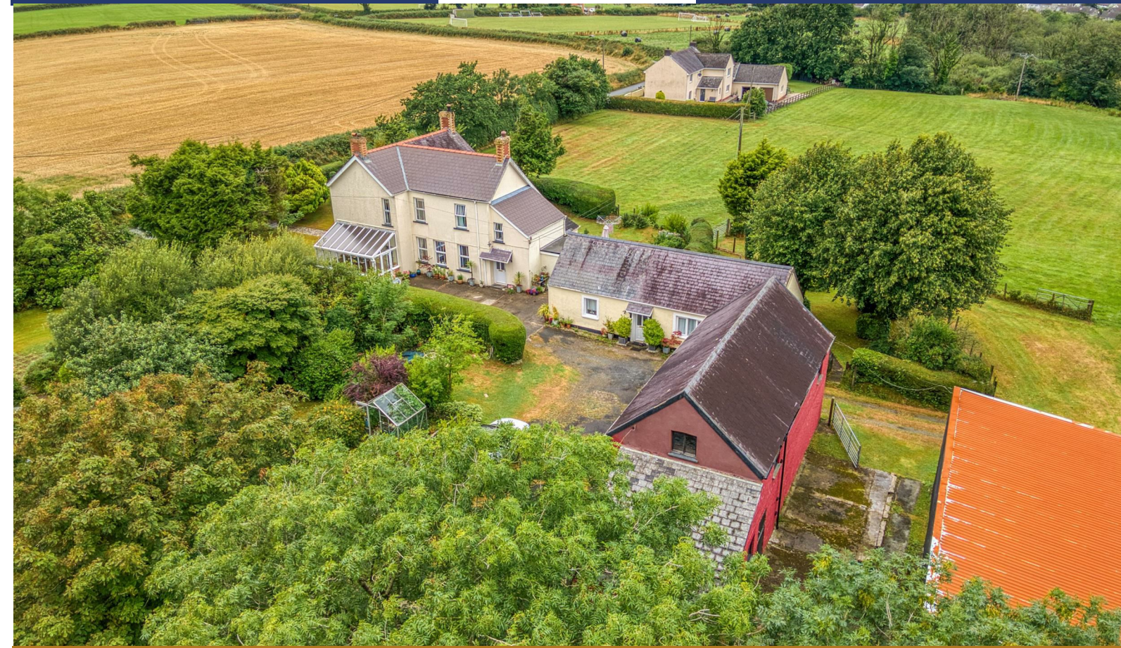
"Brynawel" Clarbeston Road, Pembrokeshire, SA63 4XA